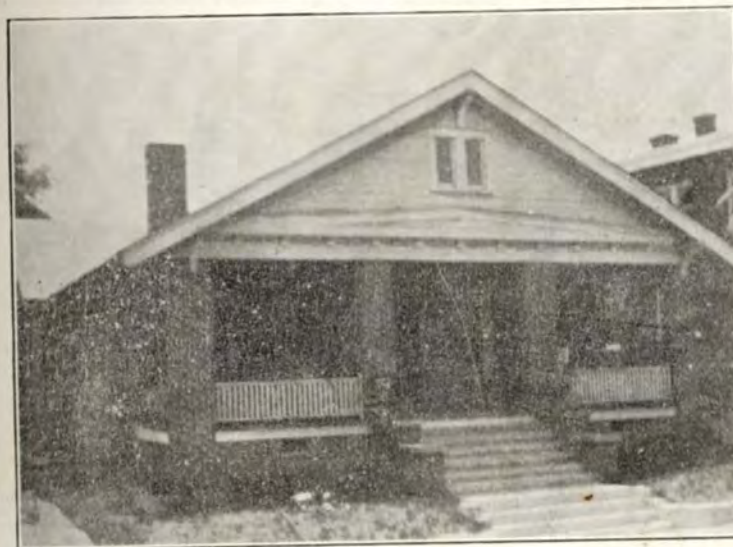
PARSONAGE OF BROAD STREET CHURCH 25 Ferguson Street Telephone 115