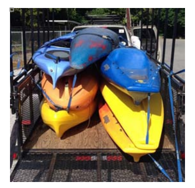
The Goodall Center trailer stuffed full of sit-on-top kayaks and a couple of boats belonging to The Space team members.