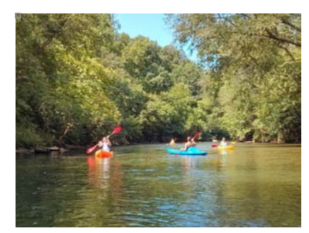
The Pacolet offered plenty of excitement on the rapids, but also some nice calm stretches to catch our breath.