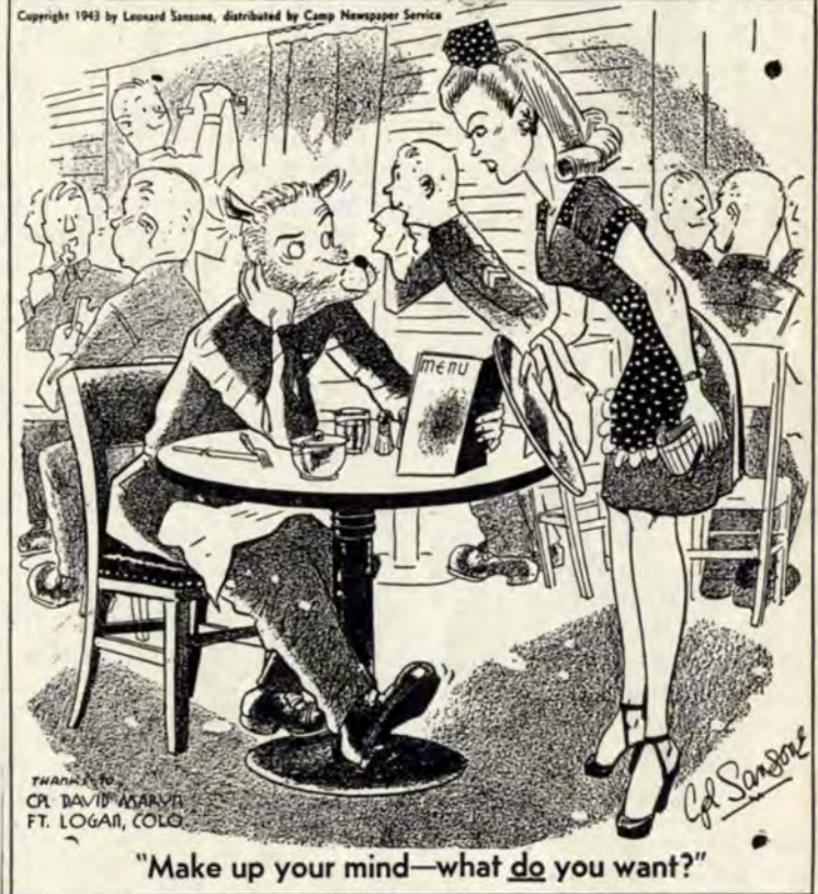
"Make up your mind—what do you want?"