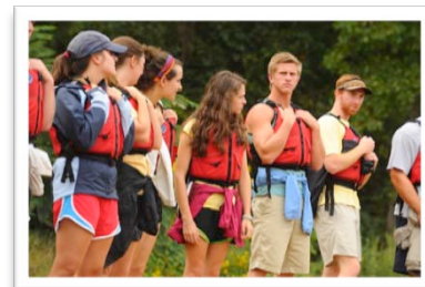
ENVS 203 students listen to instructions before beginning their river float down the Pacolet River.