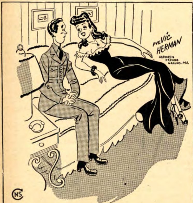
"I see the army hasn't taught you close-order drill yet!"

Copyright 1944 by Milton Caniff, distributed by Caniff