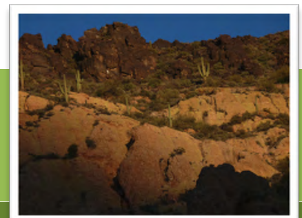
Landscape of the Superstitions Wilderness

stark volcanic features, salt flats, sand dunes, and colorful mountains. The group stopped for one night at the development Arcosanti, where the residents are working to build inventive passive solar designs to house 5000 people on 15 acres of land! Their remaining 860-acre tract has amazing remains of Native American pueblos, including rock walls that were used to trap pronghorn antelope, and several petroglyphs. The final leg of the trip was a 5-day backpacking expedition in the Superstition Wilderness, where giant saguaro cacti stood guard amongst jagged peaks that glowed red and gold in the afternoon light.