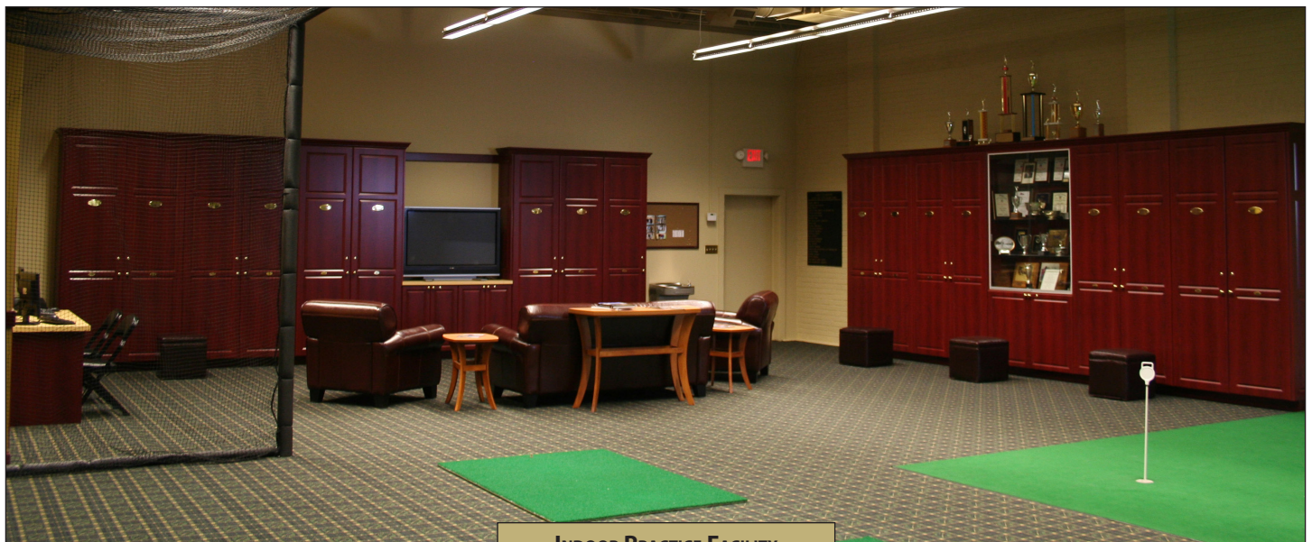
INDOOR PRACTICE FACILITY