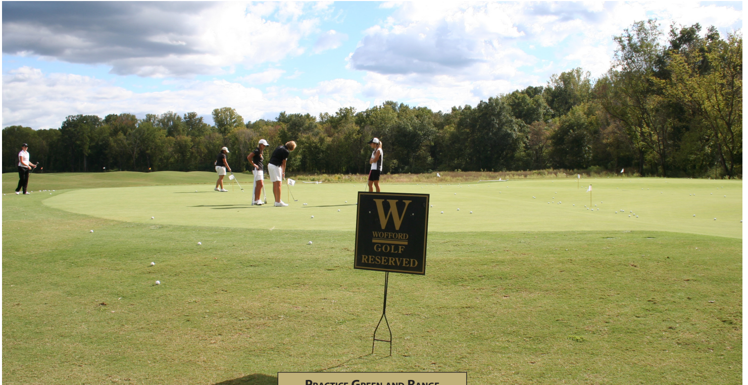
PRACTICE GREEN AND RANGE