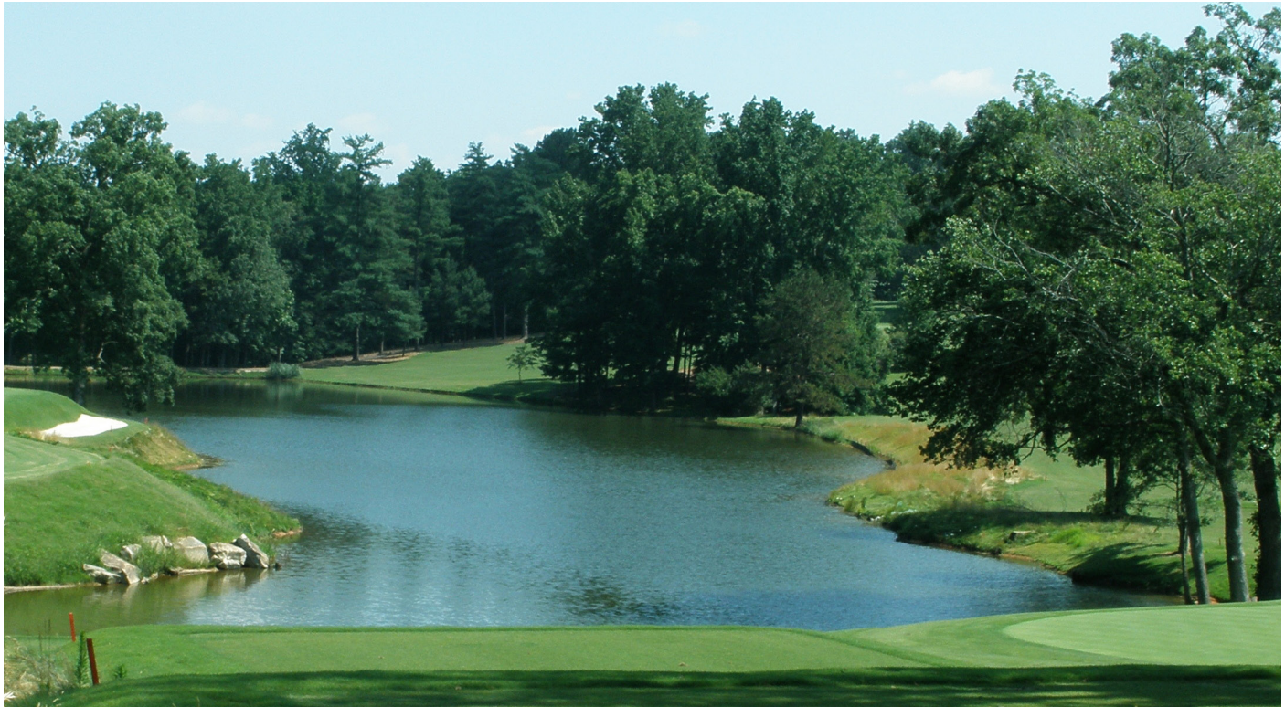
SPARTANBURG COUNTRY CLUB PLAYS HOST TO THE TERRIER INTERCOLLEGIATE

A native of Indiana and a long-time Spartanburg area resident, she graduated from Boiling Springs High School before embarking on a collegiate career at Appalachian State. She played for the Mountaineers from 1983-87 and earned a bachelor's degree in business. She served as the Mountaineers' team captain and earned medalist honors at two tournaments. In September of 2014, she was inducted into the Appalachian State Athletics Hall of Fame.