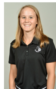
Speedy Kent Freshman