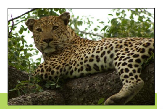
Animals on Safari during January 2020 Interim.

Safari we even got the chance to watch a wild zebra being born. Our tracker, who had worked in the bush for over twenty years, had never seen a zebra birth before that morning, which just served as a reminder of how incredibly lucky we all were to have this experience. At the end of the trip many of the students on the trip agreed that they may never be able to enjoy zoos again after seeing how happy and free the animals seemed when they weren't confined to an enclosure. I am exceptionally grateful to have been able to spend time in South Africa and experience the amazing landscapes, wildlife, and plant life that makes the environment there so special.