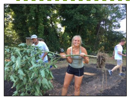
ENVS334 Sustainable Agriculture class has been working at the on-campus garden planting fall vegetables to be harvested at the end of the semester.