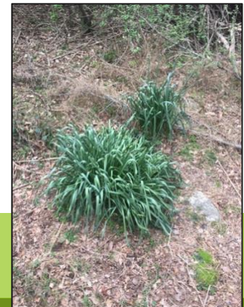
Spring daffodils at reflection site #6. The Old Home Place.