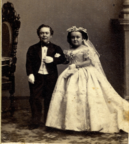
Mrs & Mrs "General Tom Thumb" in their wedding costume.

Entered according to Act of Congress in the year 1863, by E. & H. T. Anthony, in the Clerk's office of the District Court of the U. S. for the So. District of New York.